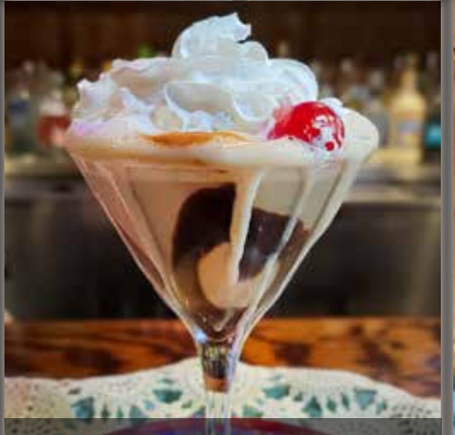
MARTINI CHOCOLATIN Vodka, Baileys, Hershey's Syrup, whipped cream and a cherry 9.99