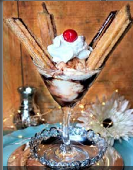
CHURROS CON NIEVE